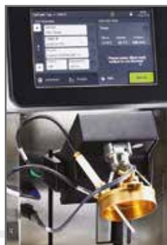
Lift-arm and touch-screen make it easy to operate