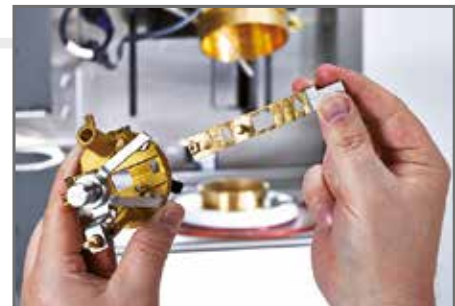
Easy disconnection, for easy and external cleaning of the cup-cover