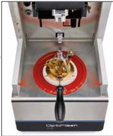
Optical fire detecting system covers entire hot area