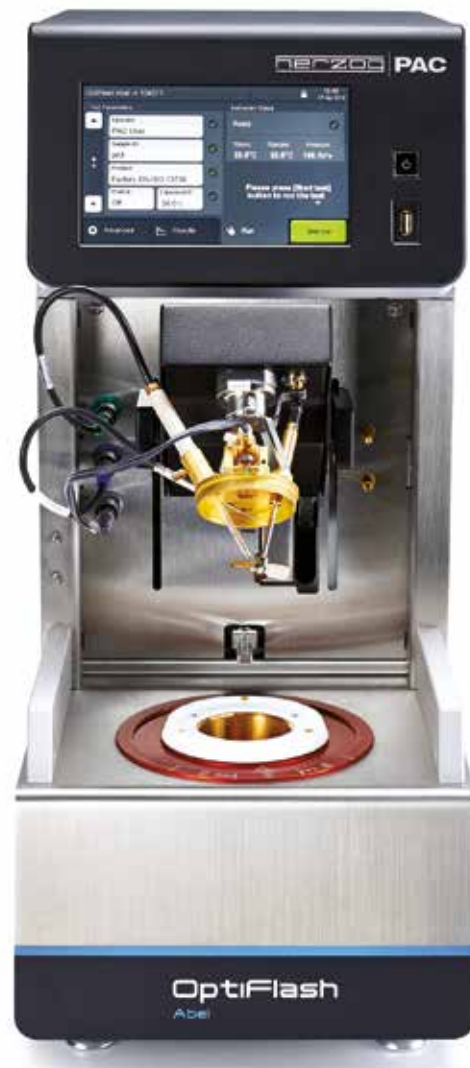
Abel model with stirrer